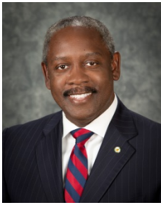
Orange County Mayor Jerry L. Demings